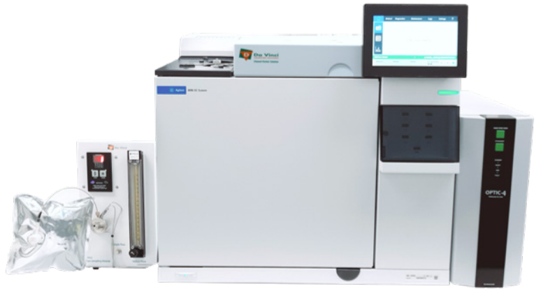
The DVLS Benzene in Air Analyzer

The multi positioning valve allows to collect samples from e.g. a Tedlar bag or taking sample directly from outside air. Up to 8 samples or standards can be automatically selected and sampled.