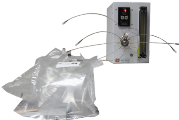
Gas Sampling Unit